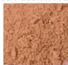
309 Passion Fruit