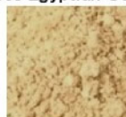
308 Egyptian Gold