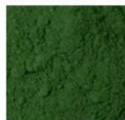
302 Dark Teal